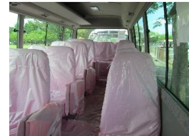
A masked special bus from/to an entry point