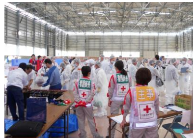
Residents meeting at an entry point