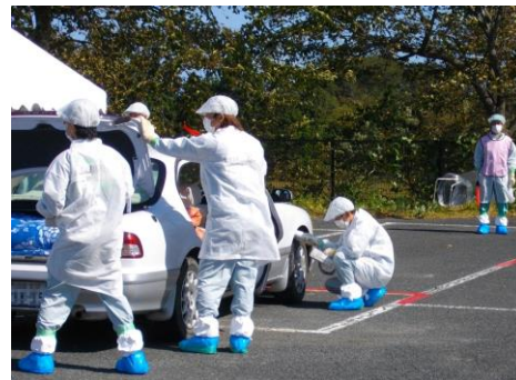
Screening of a private car