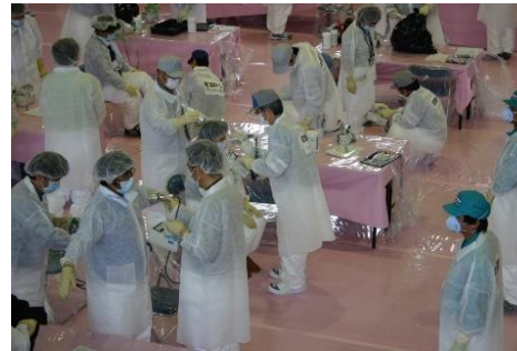
Residents taking screening at an entry point

Source: Website of the Ministry of Economy, Trade and Industry Website of the Nuclear Regulation Authority