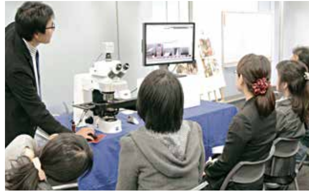
NIRS Chromosome Training Session