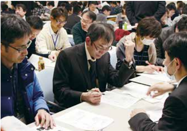
Photo: JRCS First Nuclear Disaster Response Basic Training Session Training was provided for JRCS relief team members to allow them to conduct appropriate relief activities in the event of a nuclear disaster.

For nuclear disaster preparedness, the JRCS created the Nuclear Disaster Guidelines for Preparedness, Response and Recovery (Guidelines) about its course of action and relief activities. The JRCS will make arrangements for training and relief activities according to the guidelines.