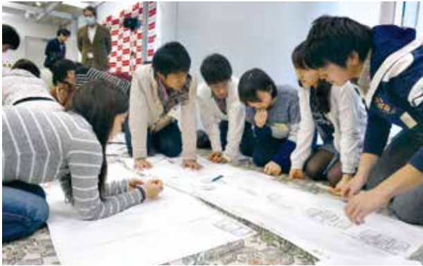
Red Cross Nuclear Disaster Seminar

The NDRC organizes/holds nuclear disaster seminars in collaboration with related organizations. The seminar reports are released through the Digital Archives.